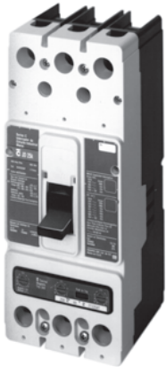
Typical J-Frame Breaker